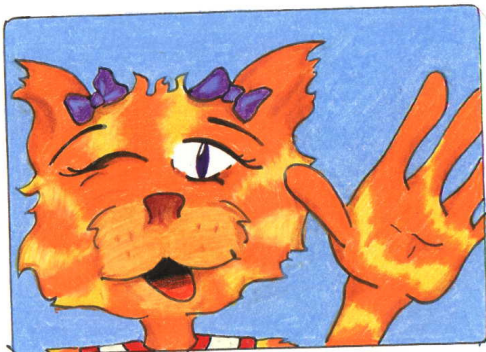
Allie Cat, age 14